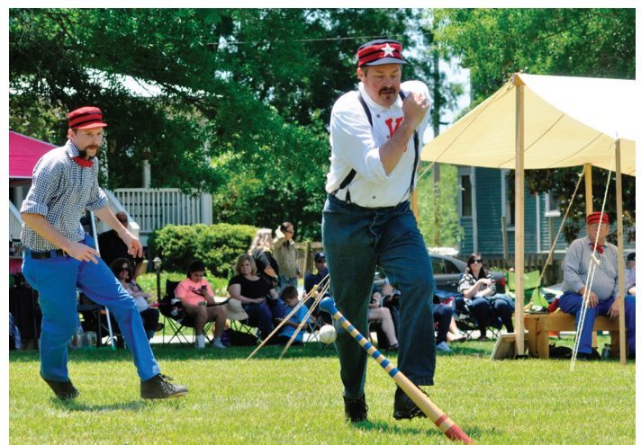
Hometown Teams, vintage baseball

The exhibit will be on display in Moultrie at Colquitt County Arts Center in spring of 2017.