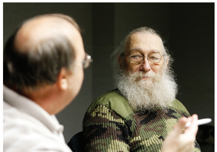
Talking Service discussion group

Talking Service Veterans Project is a program for veterans transitioning to civilian life. Participants read and discuss selections from the anthology Standing Down: From Warrior to Civilian on military themes throughout history, at times relating the book's subjects with their own experiences. With support from National Endowment for the Humanities, Georgia Humanities sponsored this pilot program in our state and is seeking additional sponsors to continue the program.