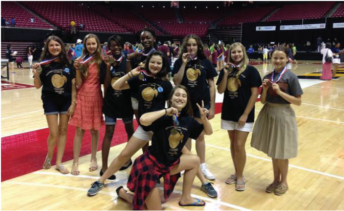
National History Day winners

Griffin-Spalding County School System is one of the top 10 users of the New Georgia Encyclopedia