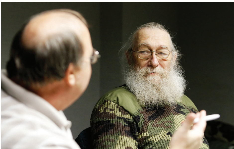
Talking Service discussion group

Talking Service is a program for veterans transitioning to civilian life. Participants read and discuss selections from the anthology Standing Down: From Warrior to Civilian on military themes throughout history, at times relating the book's subjects with their own experiences. With support from National Endowment for the Humanities, Georgia Humanities sponsored this program in Carrollton and is seeking additional sponsors to continue the program.