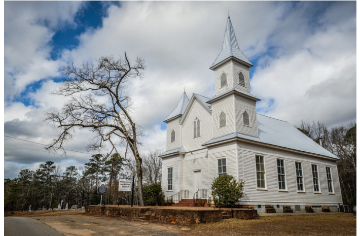
Whitesville Methodist Church