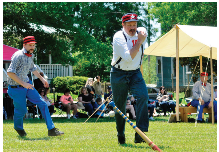
Hometown Teams, vintage baseball

The exhibit was on display in Carrollton at Carrollton Cultural Arts Center in fall of 2016.