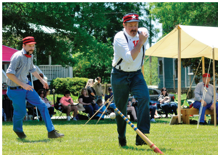
Hometown Teams, vintage baseball

The exhibit will be on display in Kingsland, Camden County Public Library in fall of 2016.