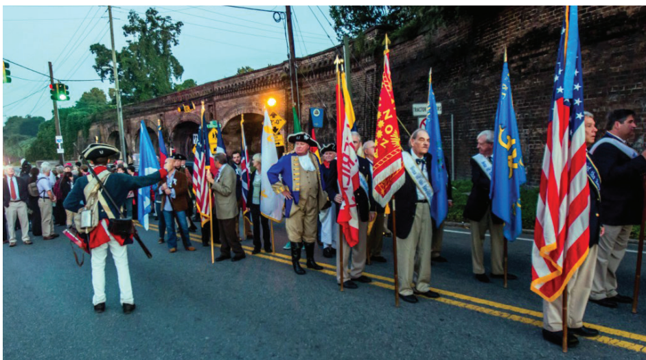
Grant award, Coastal Heritage Society

Hosted by the Coastal Heritage Society, “Revolutionary Perspectives” is an annual event dedicated to honoring and sharing the history of colonial Georgia and the events of the Revolutionary War in Savannah. In addition to a performance series and a commemorative march and ceremony, the Coastal Heritage Society offers a lecture series focusing on the American Revolution’s Southern Campaign, particularly the Siege of Savannah and the Battle of Savannah, both of which occurred in October 1779.